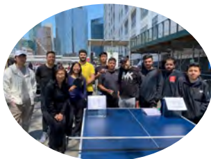
Table Tennis Tournament by Kyoko Toyama

12:00pm-2:00pm Wednesday May 22 2024 @ The Greenway (29th Street)