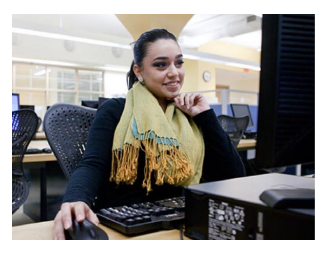
Create an account and get started today! Visit laguardia.edu/careercoach