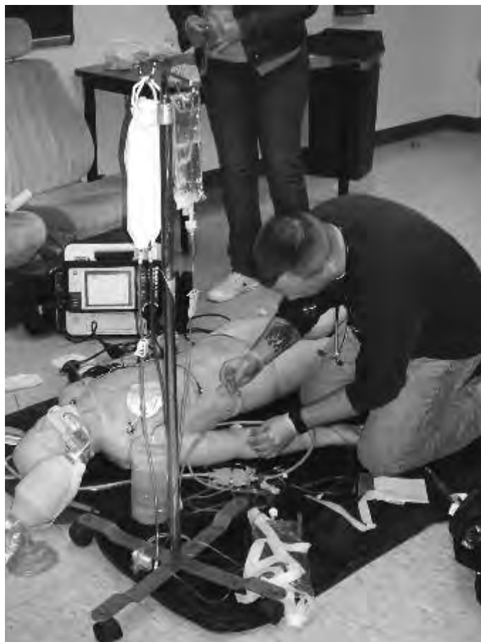
PAUL KATZ / LAGUARDIA COMMUNITY COLLEGE

Descriptions of courses in this major begin on page 145.