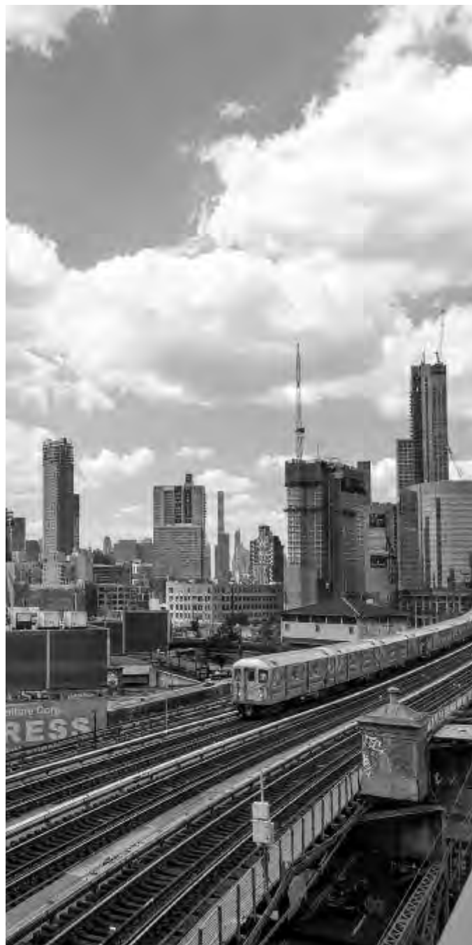
KRISTIAN LARROTA / LAGUARDIA COMMUNITY COLLEGE

Descriptions of courses in this major begin on page 109.