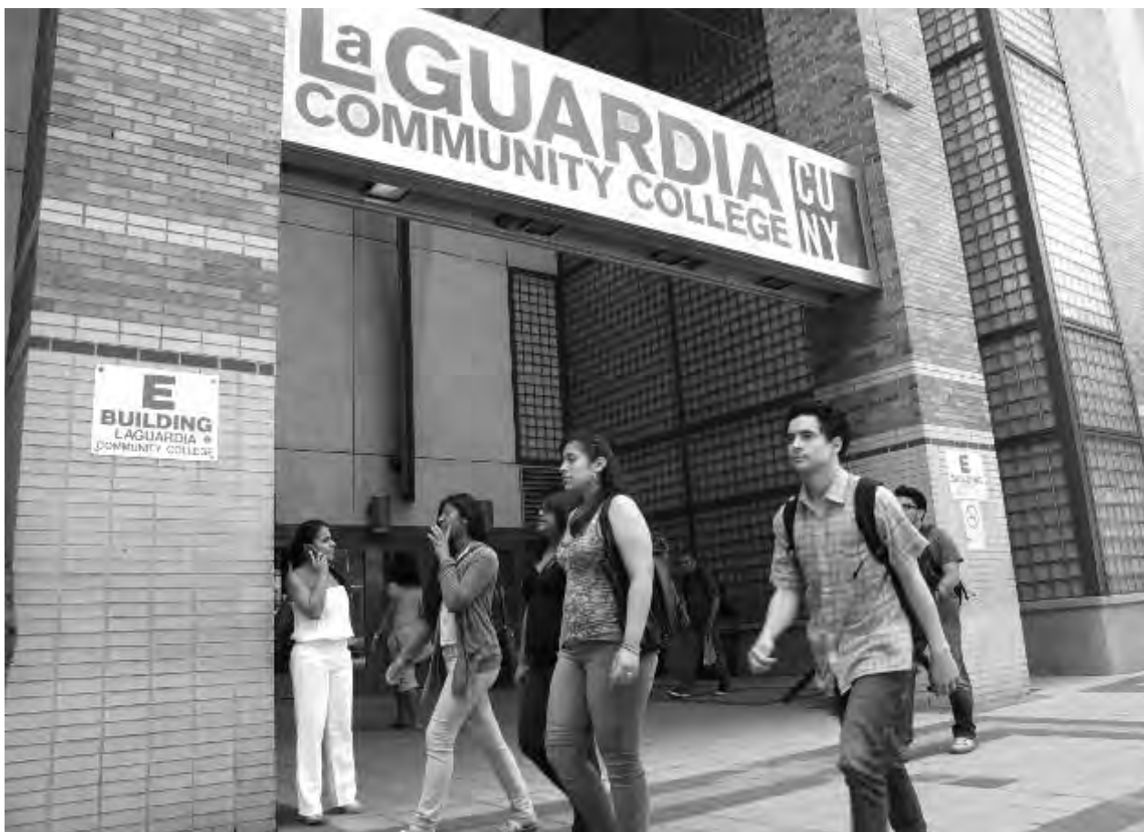
ALVARO CORZO / LAGUARDIA COMMUNITY COLLEGE

Descriptions of courses in this major begin on page 126.