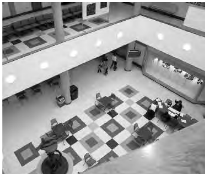
DANIELLE SALTIEL / LAGUARDIA COMMUNITY COLLEGE

Descriptions of courses in this major begin on page 162.