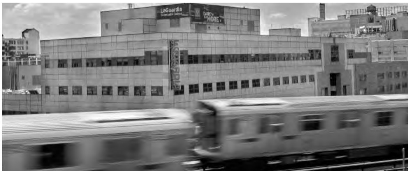
KRISTIAN LARROTA / LAGUARDIA COMMUNITY COLLEGE