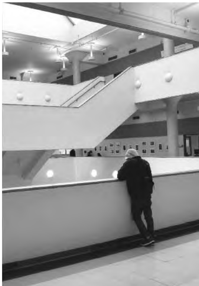
PAUL KATZ / LAGUARDIA COMMUNITY COLLEGE

Additional program information can be found on page 228.