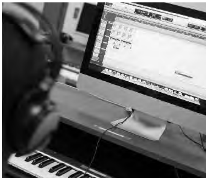
ALVARO CORZO / LAGUARDIA COMMUNITY COLLEGE