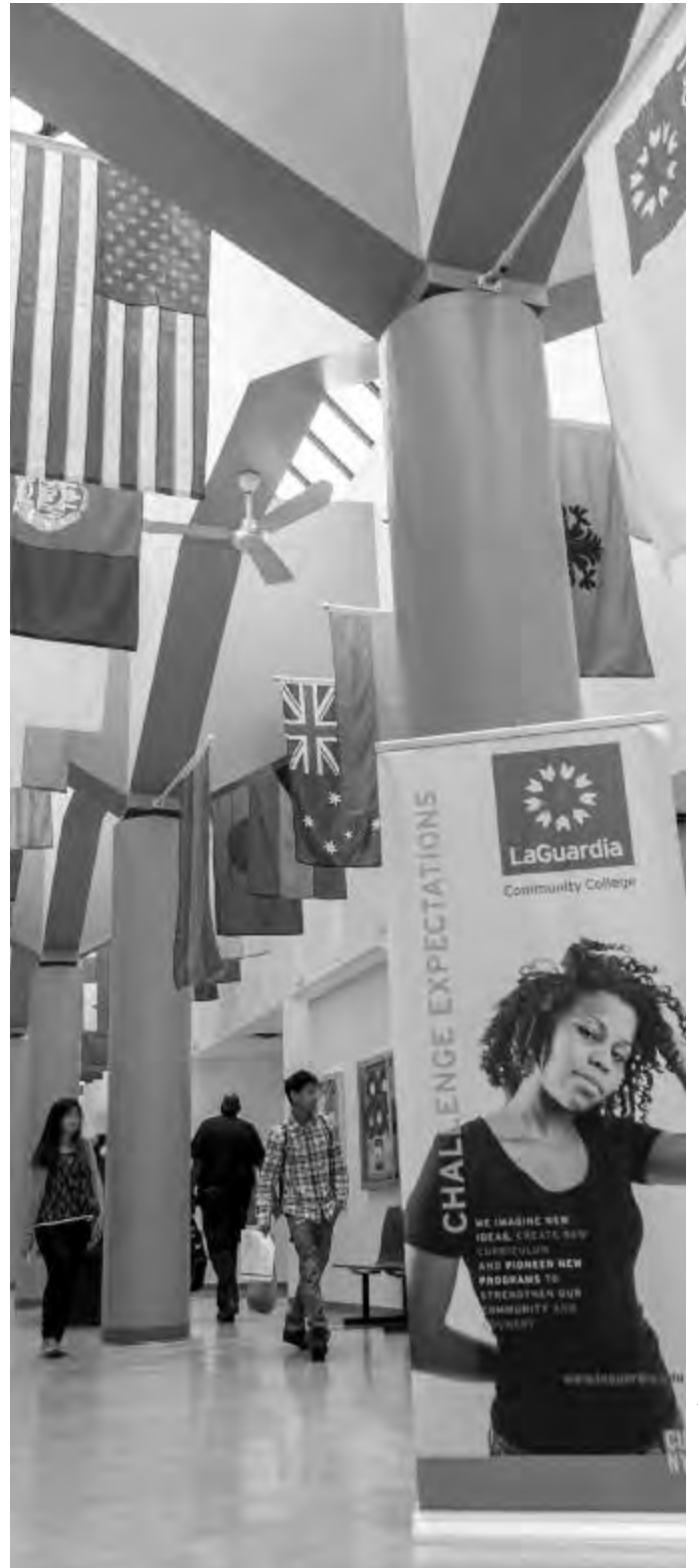
KRISTIAN LARROTA / LAGUARDIA COMMUNITY COLLEGE

Description of courses in this major can be found on page 139.