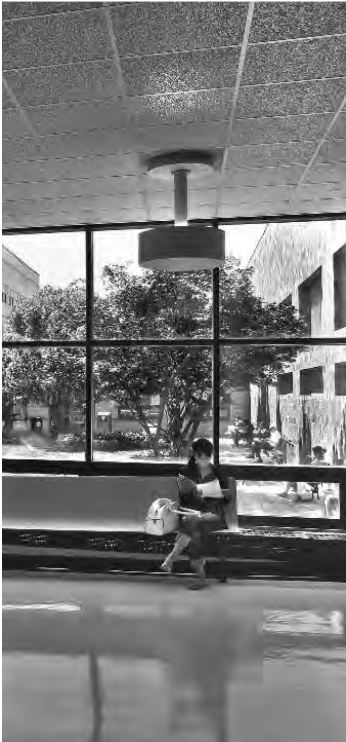
PAUL KATZ / LAGUARDIA COMMUNITY COLLEGE

Description of courses in this major begin on page 190.