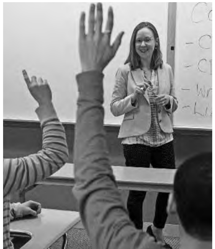
CARLOS FREIRE / LAGUARDIA COMMUNITY COLLEGE

Descriptions of courses in this major begin on page 114.