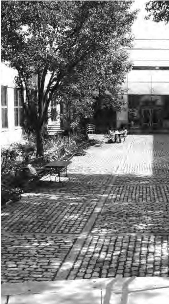
ALVARO CORZO / LAGUARDIA COMMUNITY COLLEGE