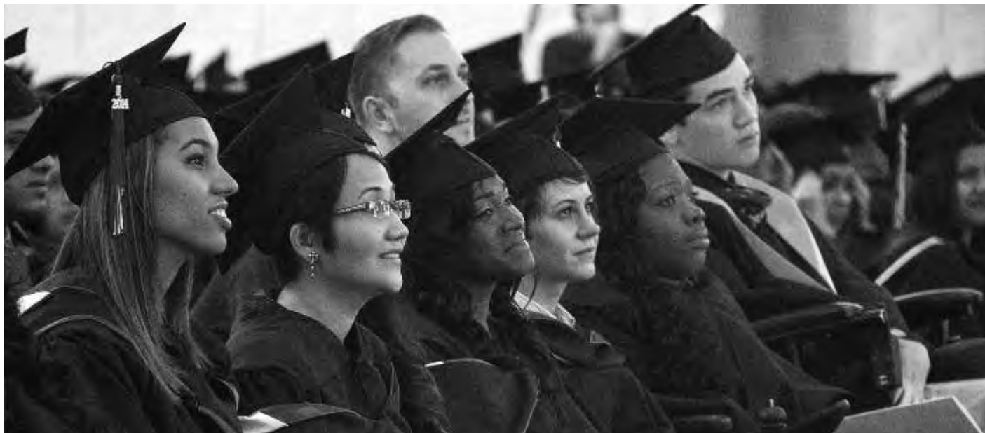
DANIELLE SALTIEL / LAGUARDIA COMMUNITY COLLEGE

Descriptions of courses in this major begin on page 107.