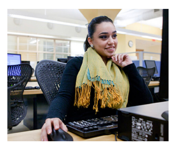
Create an account and get started today! Visit laguardia.edu/careercoach