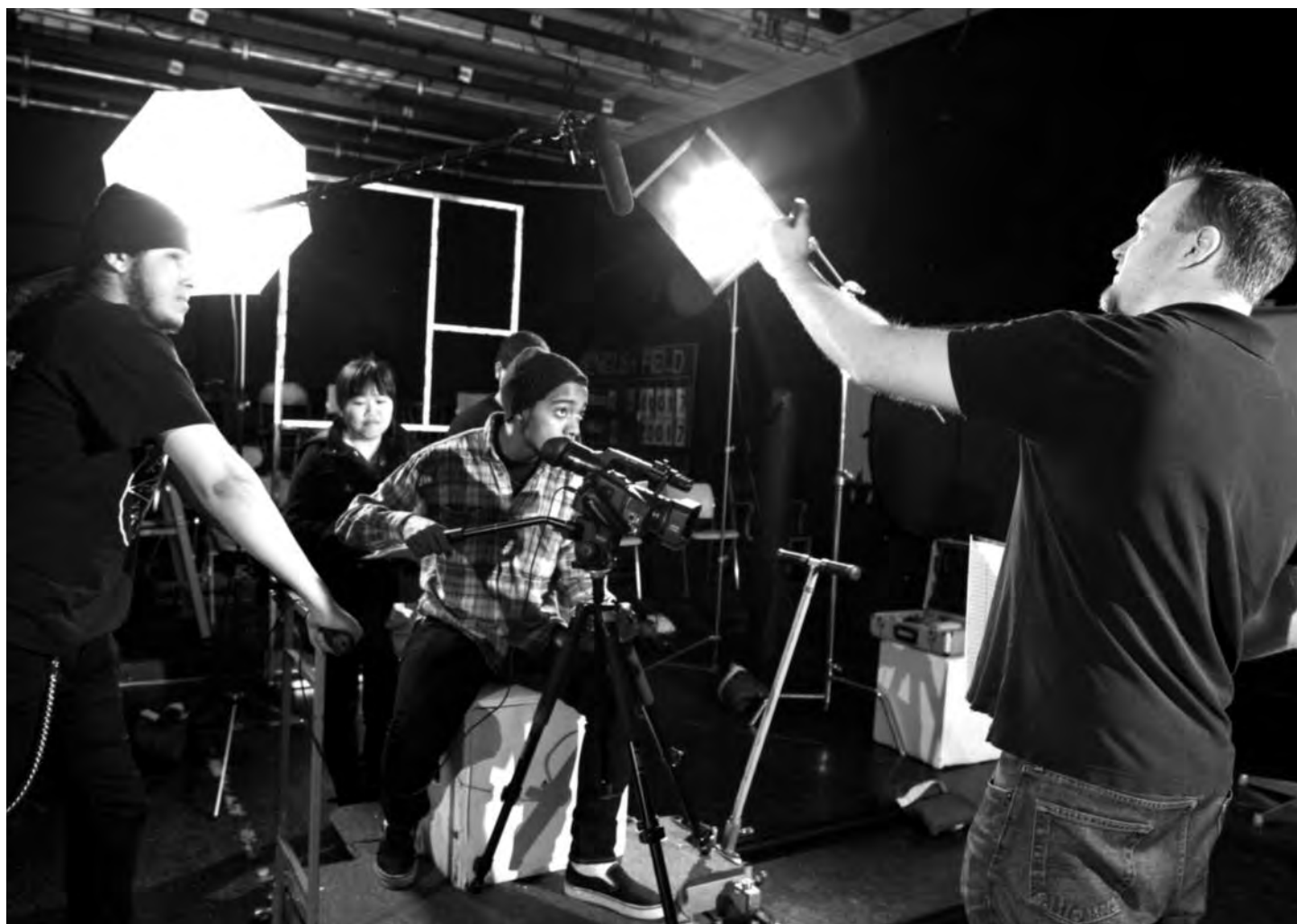
ALVARO CORZO / LAGUARDIA COMMUNITY COLLEGE

Descriptions of courses in these majors begin on page 157.