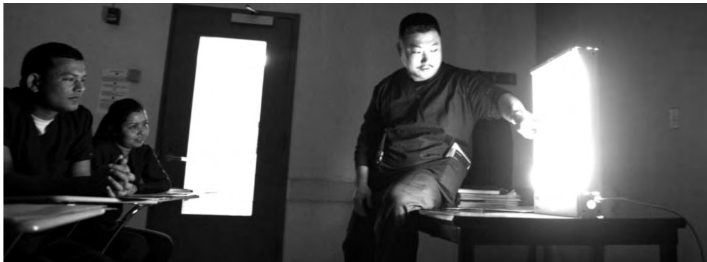
ALVARO CORZO / LAGUARDIA COMMUNITY COLLEGE

Descriptions of courses in this major begin on page 149.