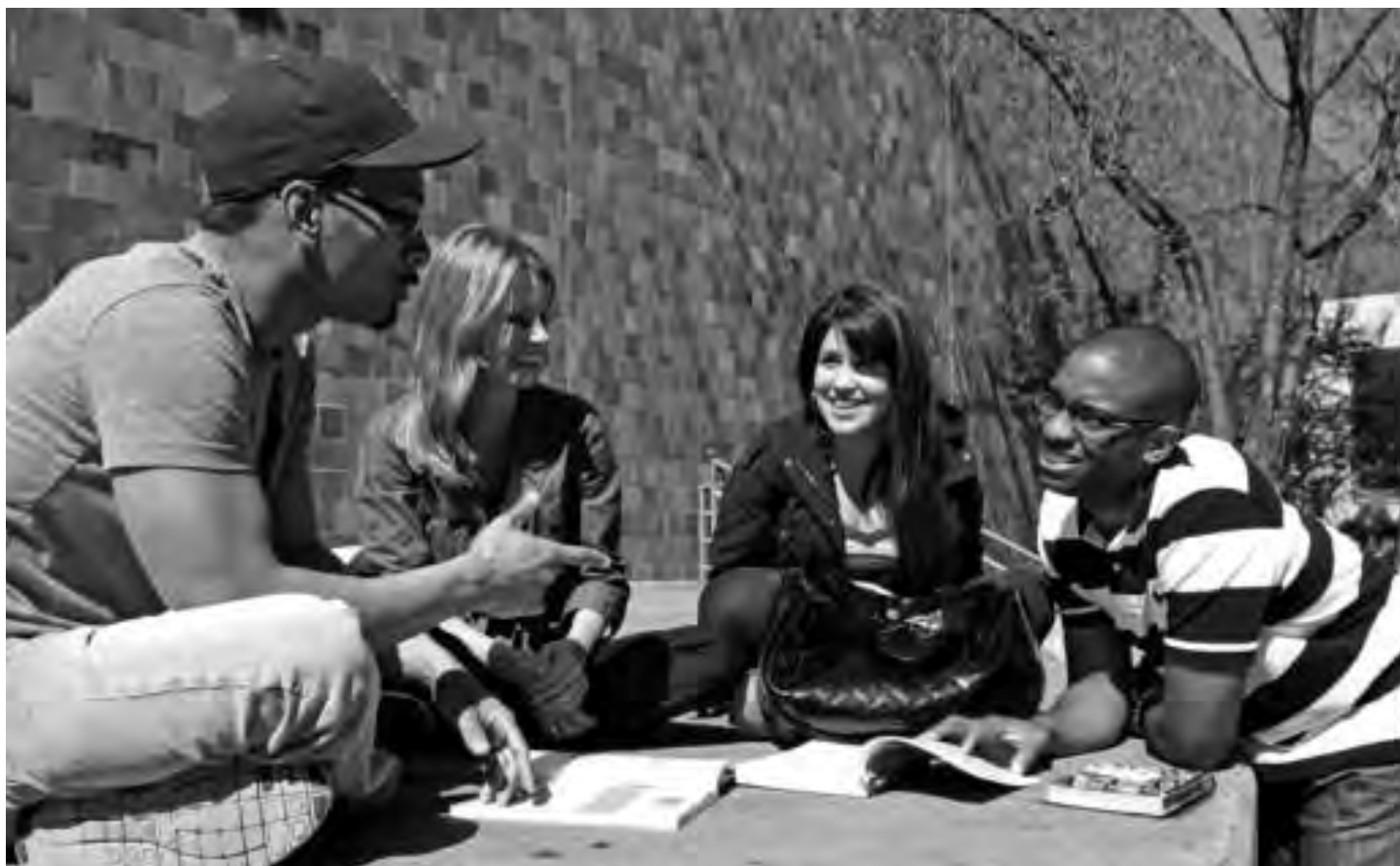
ALVARO CORZO / LAGUARDIA COMMUNITY COLLEGE

Descriptions of courses in this major begin on page 134.