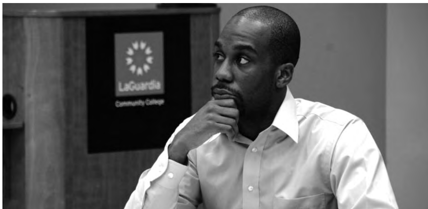
CARLOS FREIRE / LAGUARDIA COMMUNITY COLLEGE

Descriptions of courses in this major begin on page 165.