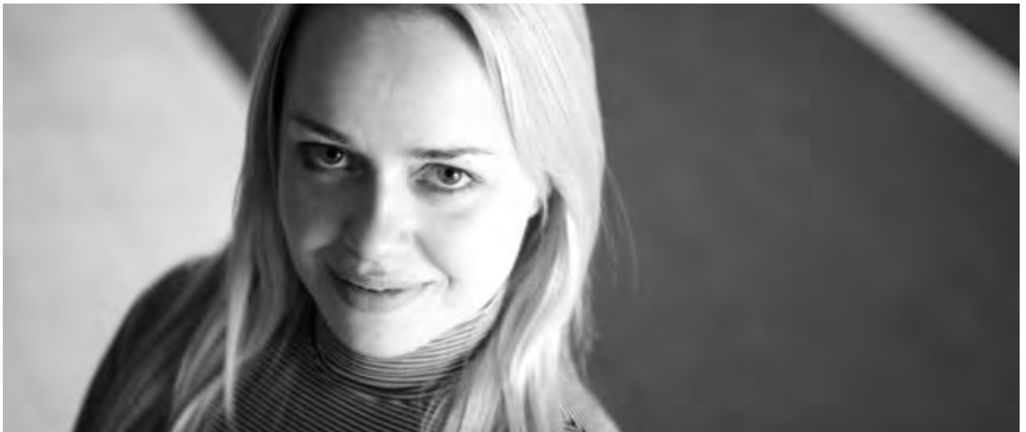
ALVARO CORZO / LAGUARDIA COMMUNITY COLLEGE

Descriptions of courses in this major begin on page 117.